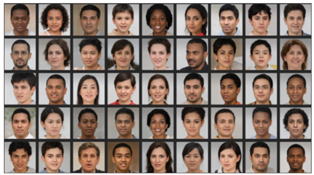
Figure 2. Some projects, like Generated Photos, attempt to reduce algorithmic bias by providing open, synthetic data for training and testing purposes.

But despite such exemplars, the movement to make data open in government is not always met with equal enthusiasm in the private sector. Access to diverse, high-quality training data and high-quality algorithms are two major variables that determine the quality and ultimately success of an AI application. Understandably, many companies keep both assets proprietary to maintain competitive advantage, as well as due to additional concerns like data sensitivity.