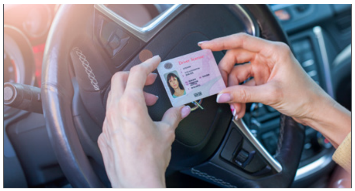
Figure 1: Some Facial Recognition Technology (FRT) applications leverage images from sources like DMV records. These practices may pose privacy risks or other ethical concerns if driver's license holders are not aware of, or do not give consent to, the use of their photos for these purposes.

does not always ensure the levels of transparency that watchdogs like the American Civil Liberties Union (ACLU) would like to see. For example, DHS uses their PIA to articulate risks to transparency in facial recognition that cannot be, or are not, mitigated. In addition, DHS often sources images from third parties, such as Department of Motor Vehicles (DMV) photo galleries (Figure 1). In these cases, it is incumbent upon the third party provider to ensure transparency through practices like notice and consent.