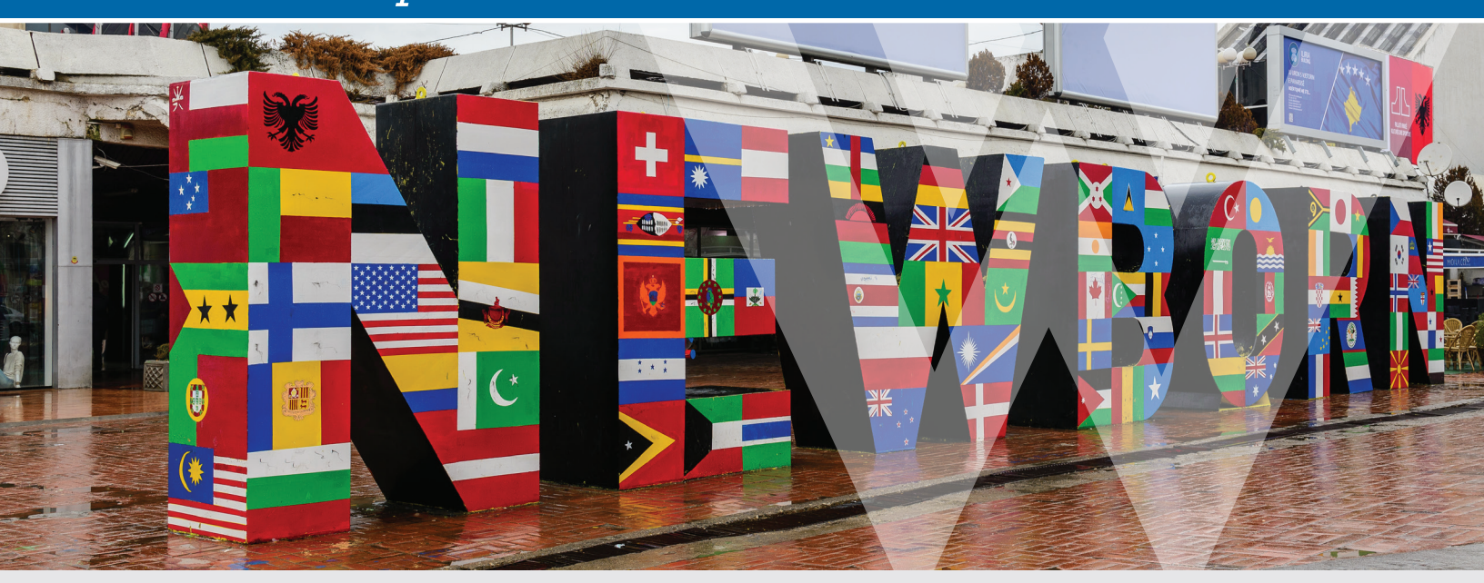
Kosovo's NEWBORN Monument, erected on the occasion of its declaration of independence on February 17, 2008. Kosovo painted the monument with flags of recognizing countries in February 2013.