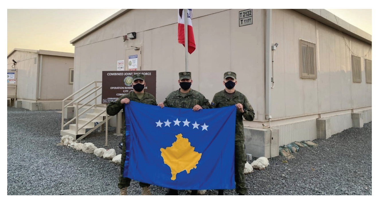
The Kosovo Army conducting its first co-deployment with the U.S. Army in Kuwait in May 2021.

entrance exams and adopting standards to assure merit-based hiring, and strengthening the