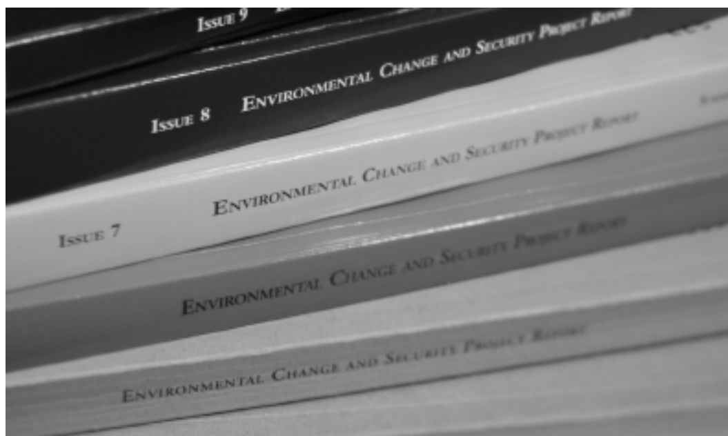
Past ECSP Reports